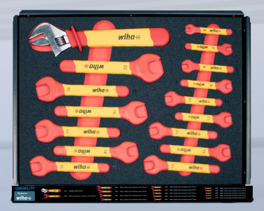
Spanner-Set I 6-24